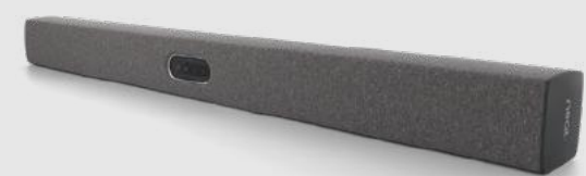
Neat Bar Pro