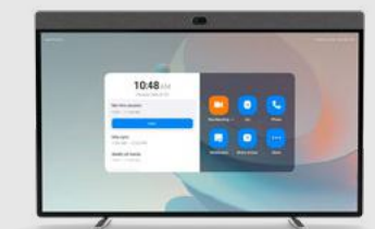
Neat Board 50