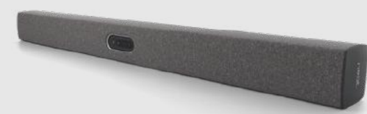
Neat Bar Pro