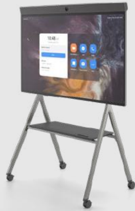
Neat Board (with floor stand)