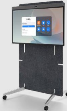
Neat Board 50 (with adaptive stand)