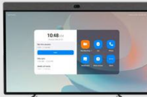
Neat Board 50