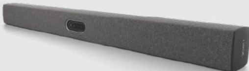
Neat Bar Pro