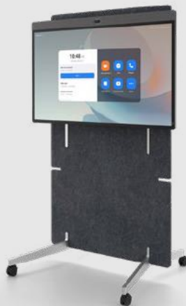
Neat Board 50 (with adaptive stand)