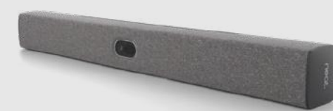
Neat Bar 2