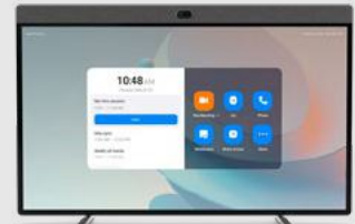
Neat Board 50