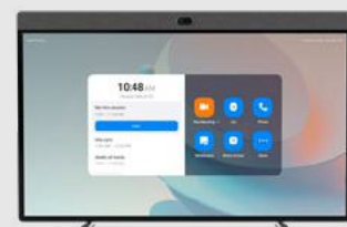
Neat Board 50