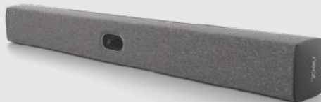
Neat Bar 2